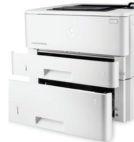
HP LaserJet Pro M402dn with optional 550-sheet tray