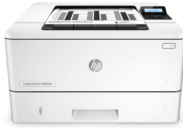
HP LaserJet Pro M402dn

Printing performance and robust security built for how you work. This capable printer finishes jobs faster and delivers comprehensive security to guard against threats. 1 Original HP Toner cartridges with JetIntelligence give you more pages. 2